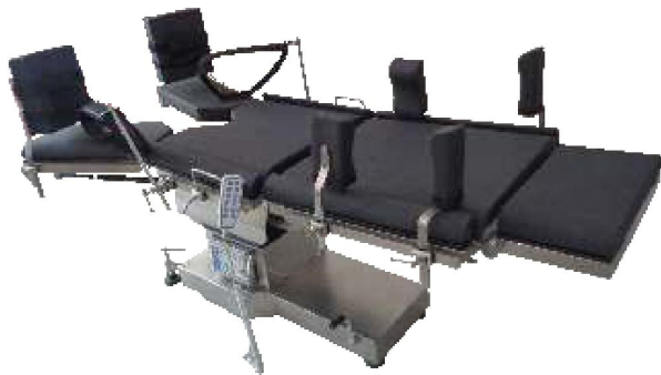
Equipped with Adjustable Side Supports, Shoulder Supports, Patient Holding Straps Holders, Thigh Belts, Foot Supports and Width Extension Plates with Side Rails and Clamps.