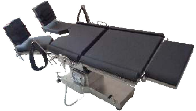
Both Side Lateral Tilt Position.