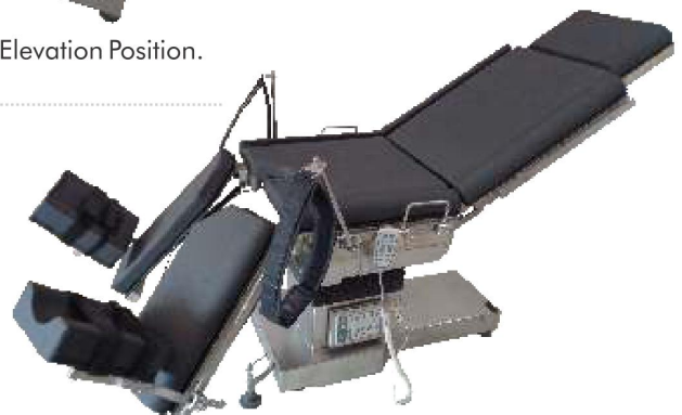
Elevated Back Rest/ Chair Position with Split and Down Legs.