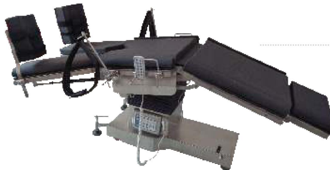
Flex/Reflux / Kidney Elevation Position.