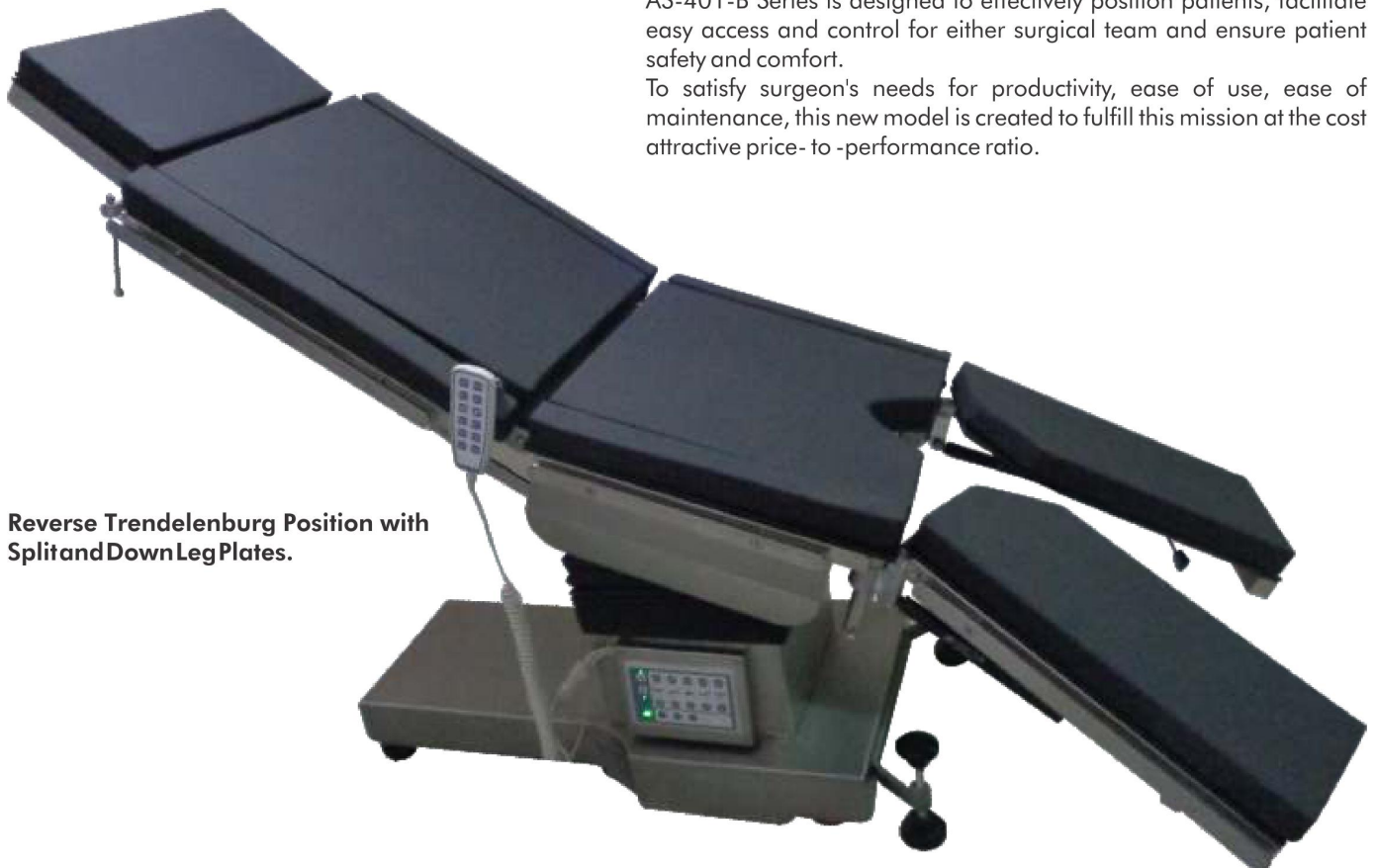
Reverse Trendelenburg Position with Split and Down Leg Plates.

To satisfy surgeon's needs for productivity, ease of use, ease of maintenance, this new model is created to fulfill this mission at the cost attractive price- to -performance ratio.