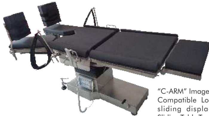
"C-ARM" Image Intensifier Compatible Longitudinal sliding displacement / Sliding Table Top.